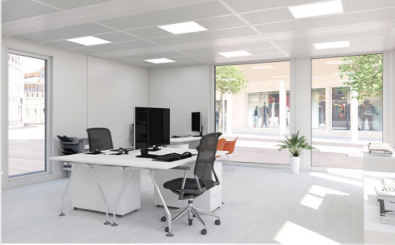
→ Bright rooms through fixed glazing