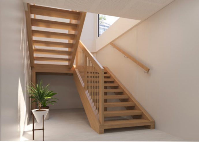
→ Solid wood interior staircase