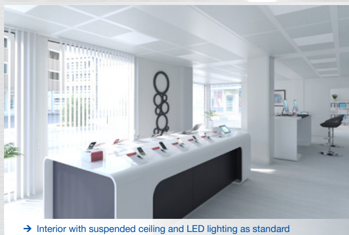
→ Interior with suspended ceiling and LED lighting as standard