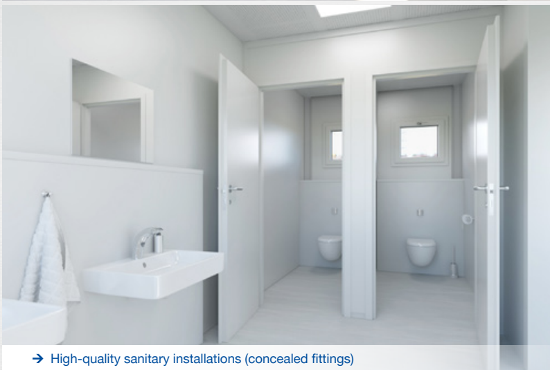
→ High-quality sanitary installations (concealed fittings)